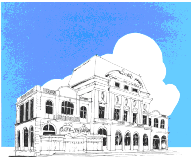
CAFE du THEATRE Place du General de Gaulle, Cherbourg

Stage 5 (18km) / R onto D904 towards Cherbourg. L onto D3 through Octeville to the Rond-Point de Poole and retrace to the Place de Verdun 200km